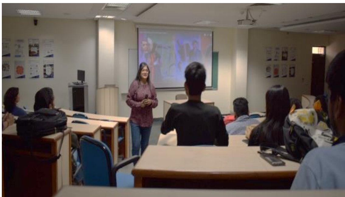
A session on Public Speaking, February 20-22, 2020

Centre for Communication and Critical Thinking organized an Anchoring session by its Literary Club Muse-In for the students during February 20-22, 2020. As an anchor has to speak a lot to connect to his audience. Students were provided with the knowledge and skills necessary to express themselves clearly, with confidence and power, in a variety of speaking situations. The session was a hands-on session where students enacted as anchors for various situations.