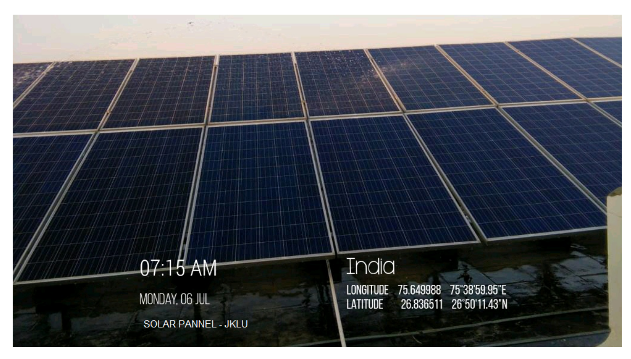
Option1: Roof top solar energy panels of 400 kW capacity